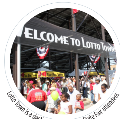
Lotto Town is a destination for Indiana State Fair attendees