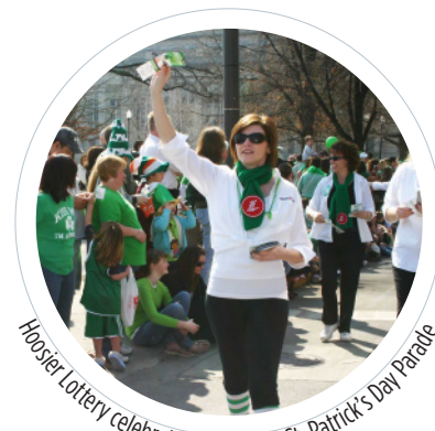
Hoosier Lottery celebrated luck at the St. Patrick's Day Parade

As always, we sought to achieve profitable growth while maintaining the security and integrity of our data and our games. Our Security and Information Technology departments are integral to the execution of a game launch, a game change and our promotional drawings in addition to their daily responsibilities that keep our system running 24-7.